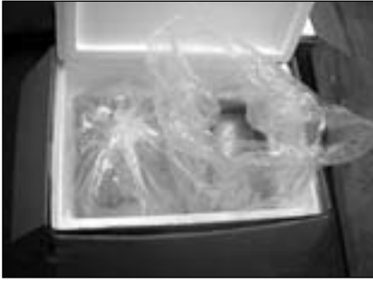
Figure 4. PL reception using traditional bags with oxygen

of shrimp (100 to 200) in a floating container in the pond. The shrimp are then collected 24 to 48 hours later to estimate survival rates.