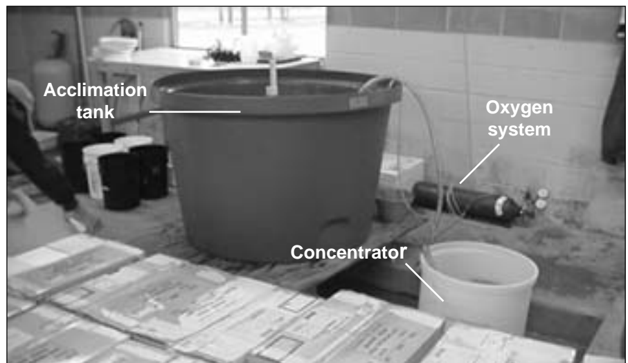
Figure 6. Shrimp reception showing acclimation tank, oxygen system and concentrator