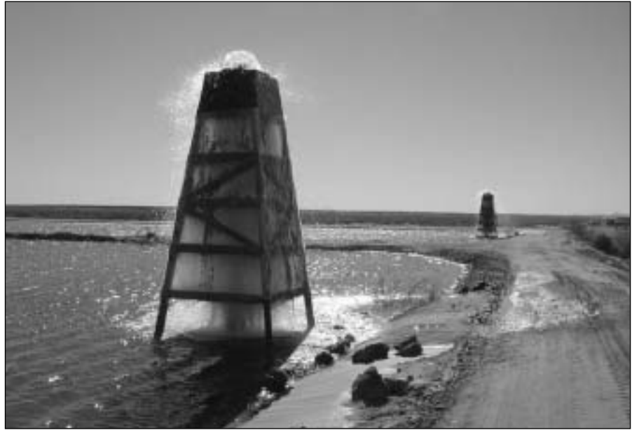
Figure 1. Degassing tower

Another problem with inland waters is that they are often supersaturated with gases such as H 2 S or CO 2 , and/or minerals such as iron, that may cause problems as they come out of solution. Some of these problems can be minimized by using a settling/ageing pond or aeration/contact towers (Fig. 1).