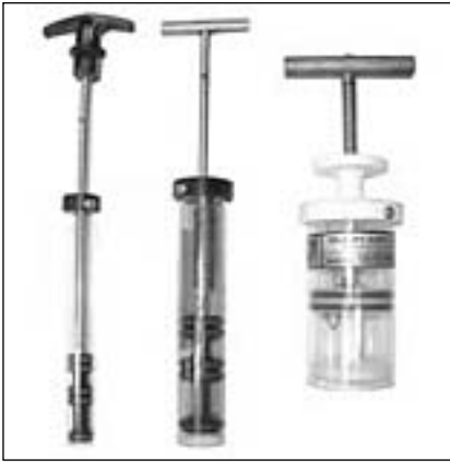
Figure 8. Three sizes of Henson-Stempel pipettes

around the top of the container; this will cause you to overestimate the number of shrimp. The contents of the beaker are then placed in another container with clean water until at least seven samples are taken. The first five sub-samples should be counted. We prefer using a spoon to remove the shrimp individually, but using an eye dropper or pouring the shrimp into another container also works. Once five samples have been counted, the mean, standard deviation and coefficient of variation ( CV = 100 \times \text{st. dev.}/\text{mean} ) are calculated. If the CV is above 10 percent the remaining two samples should be counted. If the CV is 10 percent or less you do not need to count the remaining samples. If the number of shrimp in one sample is very different from the others, it should be discarded. Once the counts are made you can determine the total number of shrimp.