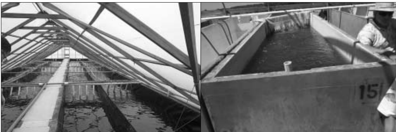
Figures 3a and 3b. On-farm nursery tanks

If the salinity of the receiving water differs by more than 4 ppt from the shipping water, the shrimp will need to be acclimated gradually to the salinity of the culture water. This can be done over a relatively short period of time (acclimation) or over an extended period of time (acclimatization). With very low salinity water ( < 4 ppt), the longer the period of acclimation the easier the transition will be for the shrimp. It takes 24 to 48 hours for a shrimp to completely adapt to a new salinity. Thus, mortality might occur 2 days later and the farmer might be confused as to the cause of death. If the shrimp are released into a pond where survival cannot be monitored, a sample of shrimp should always be held back to evaluate survival. This is often done by placing a known number