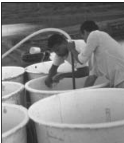
Figure 2. On-farm acclimation and counting

Two acclimation strategies are commonly used by shrimp farmers. One is temporary holding (Fig. 2) followed by short-term acclimation (less than 8 hours). The second involves longer holding or nursing (Figs. 3a and 3b) followed by a slow acclimation. Both techniques have advantages and disadvantages. Short-term acclimation can be used only if the PL are old