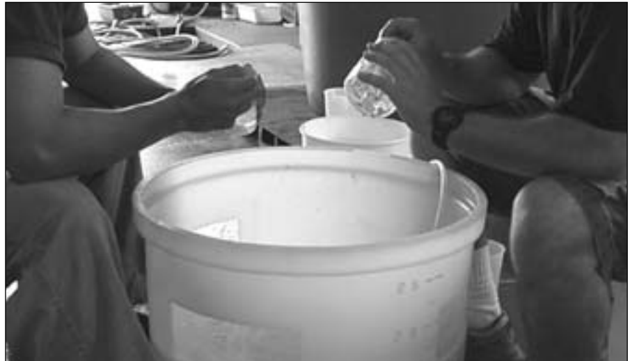
Figure 5. PL concentrator showing PLs being counted